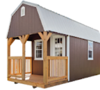
Lofted Barn Cabin