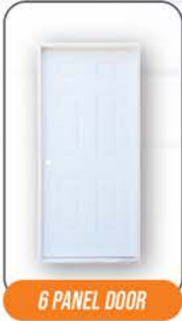
6 PANEL DOOR