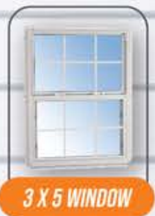
3 X 5 WINDOW