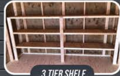
3 TIER SHELF