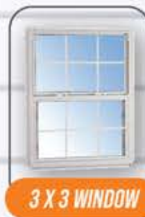
3 X 3 WINDOW