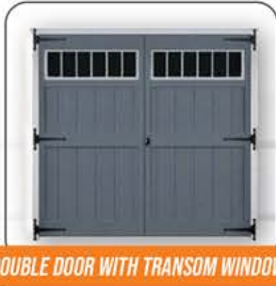
DOUBLE DOOR WITH TRANSOM WINDOWS