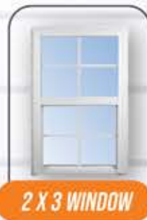
2 X 3 WINDOW