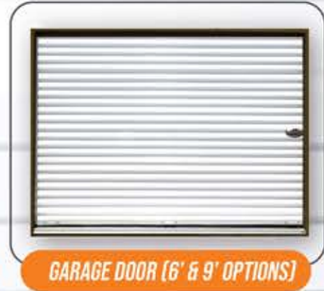
GARAGE DOOR (6' & 9' OPTIONS)