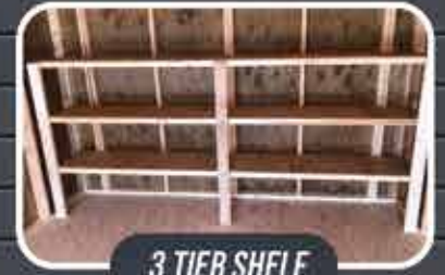
3 TIER SHELF