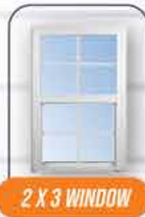
2 X 3 WINDOW