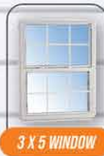
3 X 5 WINDOW