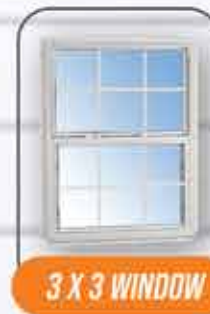
3 X 3 WINDOW