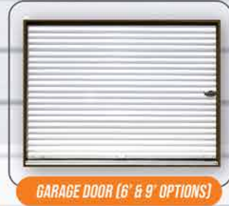
GARAGE DOOR (6' & 9' OPTIONS)