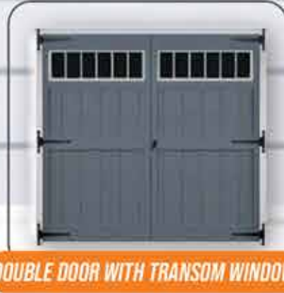
DOUBLE DOOR WITH TRANSM WINDOW