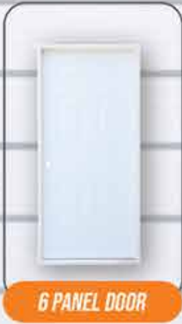
6 PANEL DOOR